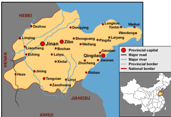
The Shandong Province, China

The Laoshan District and Columbia have been sister cities since 2006.